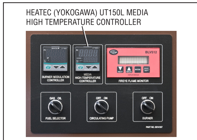
Figure 1. Media high temperature controller.

The maximum limit for a single line HCS heater is not the same as the limit for a HC heater with a manifold. On single line heaters set the maximum limit to at least 50 degrees F above setpoint of the modulating controller. On heaters with manifolds set the limit to at least 80 degrees F above the setpoint of the modulating controller.