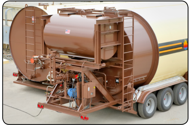
Horizontal calibration tank mounted on the rear frame extension of a Heatec Heli-Tank™ portable asphalt tank.