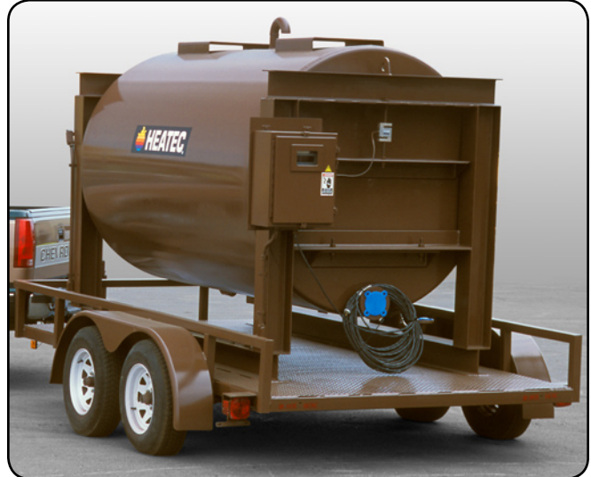
Heatec portable calibration tank is permanently trailer-mounted.