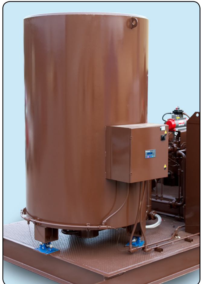
Calibration tank mounted on a skid with metering package and hot oil heater.