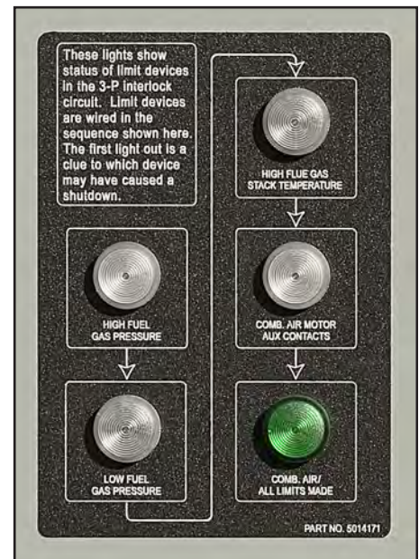
Figure 3. Status lights.

The control panel also has status lights (Fig. 3). The status lights work in conjunction with the Fireye controls to help you pinpoint the cause of an abnormal shutdown caused by the 3-P interlock circuit. If this happens, the burner display will show a message that includes the words: LOCKOUT 3-P INTLTK OPEN . The first status light that is out indicates which one of the interlock devices caused the shutdown.