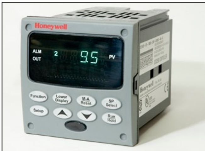
Figure 1. Honeywell Controller DC2500-EE-1000-200-00000-00-0.

Honeywell controllers purchased from Heatec are normally set at our factory and require no further setup. However, the controller can be set in the field using the information shown in Figure 3 .