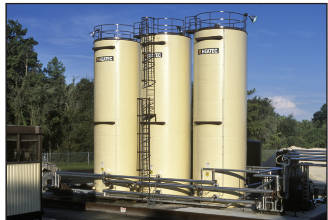
Figure 2. Heatec vertical asphalt tanks.