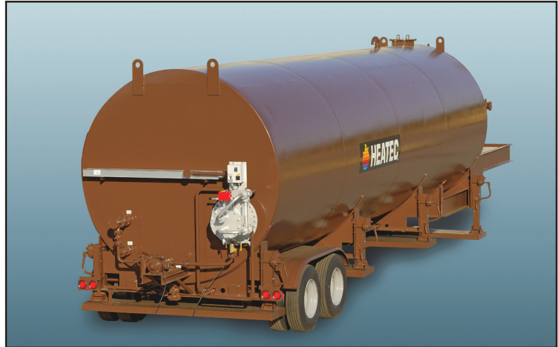
Figure 1. Heatec portable fuel tank .

This is empty space in the top of the tank reserved for overflow control. It also allows for thermal expansion of the fuel. This space normally extends downward several