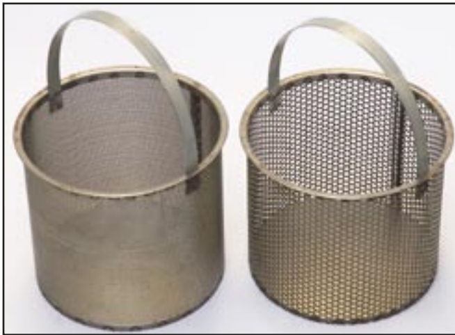
Figure 1. Left: fine strainer. Right: coarse strainer

Heatec makes two sizes of strainers: a fine and a coarse ( Figure 1 ). The coarse strainer has 1/4-inch openings. The fine strainer has 5/64-inch openings. We currently provide the fine strainer as standard unless our customer specifically requests coarse strainers instead. We do not recommend the coarse strainer for normal use.