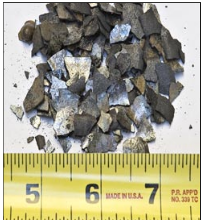
Figure 2. Debris that might pass through a coarse strainer.

The warranty on Viking pumps limits the size of the openings in the strainer to 10 mesh or 0.075-inch. This is comparable to the openings in our fine strainer. Consequently, if you choose to use a strainer with openings of a larger size, Viking is not obligated to cover the pump under warranty.