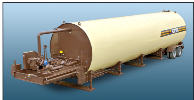
Figure 2. Heatec portable asphalt tank.

portable fuel tanks that incorporate pressure transmitters. The Honeywell manual is a PDF file on a computer CD.