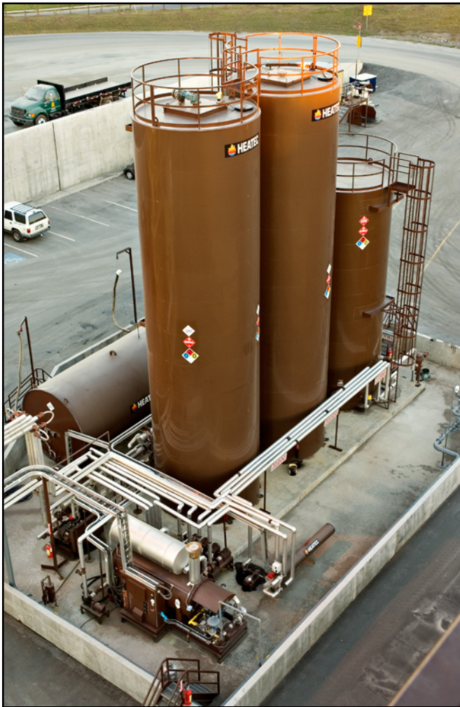
Figure 2. Heatec vertical asphalt tanks equipped with radar sensors for level indications.

The operator needs to be aware of the level (in feet) that represents “full”. This is because the display will not show any feet higher than what is shown for a 20 mA signal. Remember, the 20 mA is the maximum signal and represents 100 percent.