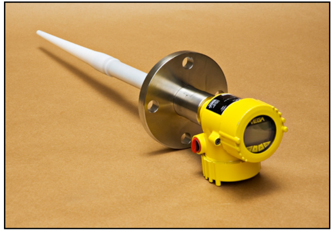
Figure 3. The Vega radar sensor outputs a 4–20 mA signal in response to feedback from the radar beam it emits to determine asphalt level.

Heatec fuel preheaters use a 4–20 mA circuit to transfer signals from a Yokogawa temperature controller to a