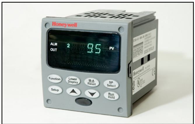
Figure 4. Honeywell controller displays asphalt levels in feet and tenths of a foot.

Triac valve that modulates the flow of hot oil that heats the fuel.