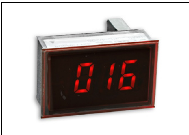
Figure 1. Datel display.

Please refer to Heatec Tec-Note 9-06-177 for more information on levels and the Siemens pressure transmitter.